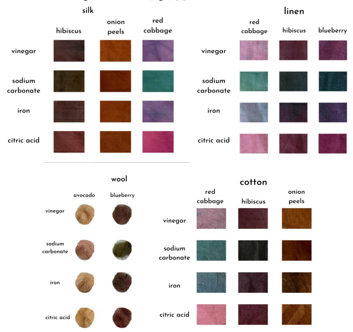
Fig. 2: Results on color modification applied to different type of textile

To create even more colors, it was decided to use 4 color modifiers: vinegar, baking soda, iron and citric acid. The used recipe to create the modifiers is: 100 ml vinegar +200 ml water; 25 gr backing soda + 300 ml water; 10 gr iron + 300 ml water; 10 gr citric acid + 300 ml water. Next are the obtained results using these mediums. (Fig.2) [7]