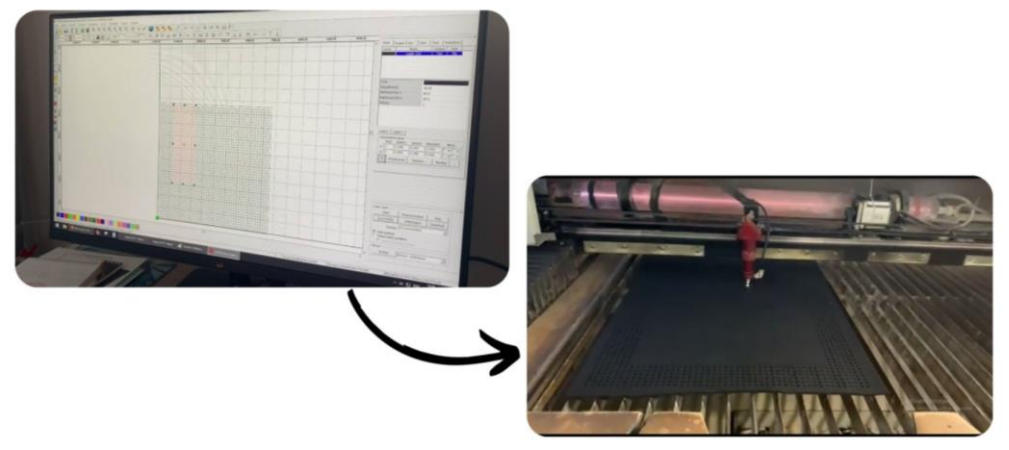
Fig. 4: The process of laser cutting the felt for the canva.

Based on this the work started by first creating working canva by using a laser to cut the canva from felt. (Fig.4) [9]