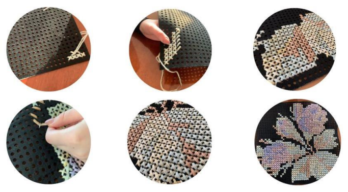
Fig. 6: The process of creating the embroidery.

After preparing all the necessary tools and components, the embroidering work started. (Fig.6)