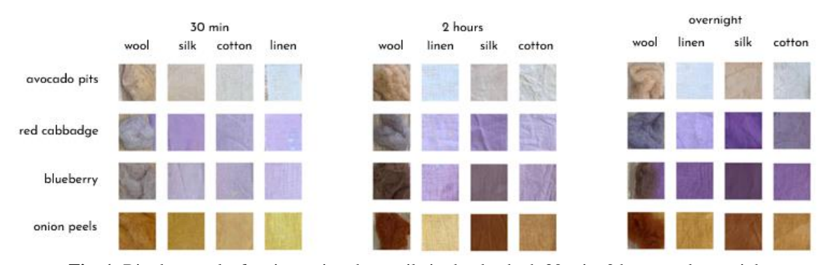
Fig. 1: Bio dye results for simmering the textile in the dye bath 30 min, 2 hours and overnight.

For the vegetable fibers, unbleached cotton and linen, sodium bicarbonate is used, 2 spoons of sodium bicarbonate to 4l of water. For the animal fibers, wool and silk a warm bath was given to the fibers. [7] The next part is the mordanting step. This is a substance, typically an inorganic oxide, that combines with a dye or stain and thereby fixes it in a material. Alum was selected as the mordant. The ratio is for animal fiber 10-20% of WoF, for plant-based fibers is 10-15% of WoF. After all of the above is done, the preparation of the dye bath was started. Through the vast majority of different natural dyeing options, it was decided to use the next ones: Onion peels, blueberry, red cabbage, avocado pits and hibiscus. Based on this the following colors were obtained. Figure 1 shows the colors obtained by using different coloring substances (onion peels, blueberry, red cabbage, avocado pits and hibiscus), for four types of textile materials (wool, silk, linen, cotton), for three variations of time periods (30 min, 2 hours, overnight).