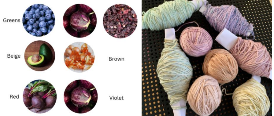
Fig. 3: Results of the dye process of seminatural threads

Because the thread is semi-natural, it can be seen that as a result of bio-dyeing the colors are not as intense as in the previous trial. The obtained colors are calmer and pastel. Thanks to the preparation of the fibers and doing the mordant step the fastness of the dyed samples is guaranteed (Fig.3)